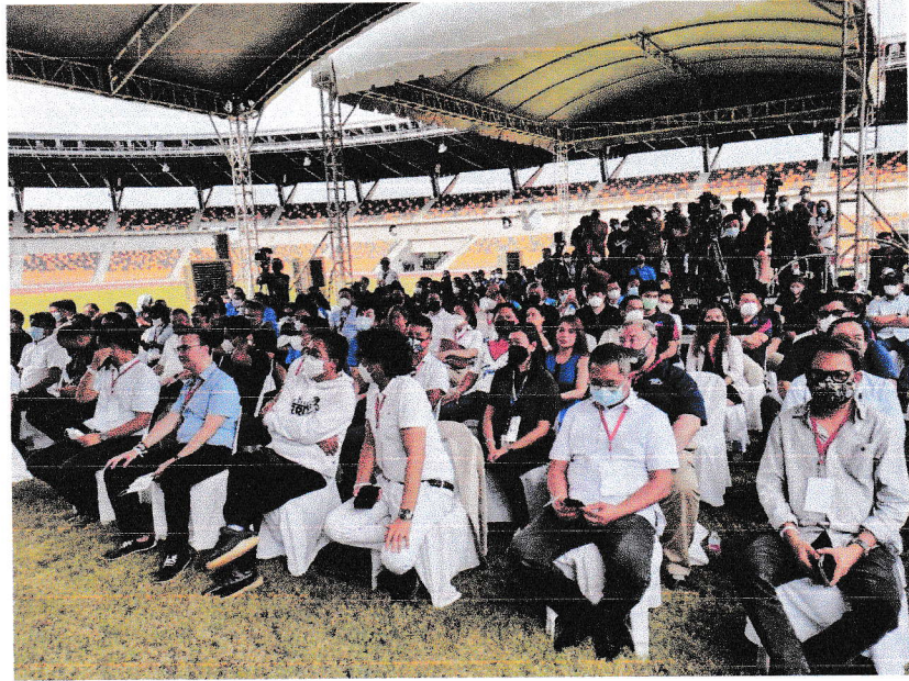
Photo 4: Guests arrive in New Clark City for President Rodrigo Duterte's inspection of the National Academy of Sports (NAS) campus on 14 June 2022.